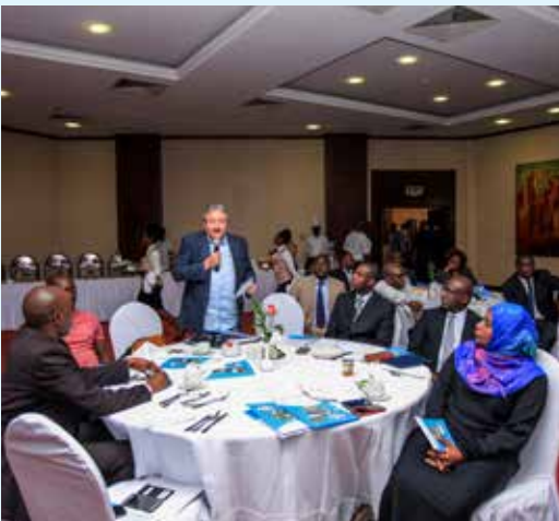
The engagement was interactive with a number of stakeholders submitting feedback on ways CAA can boost services of the aviation industry.