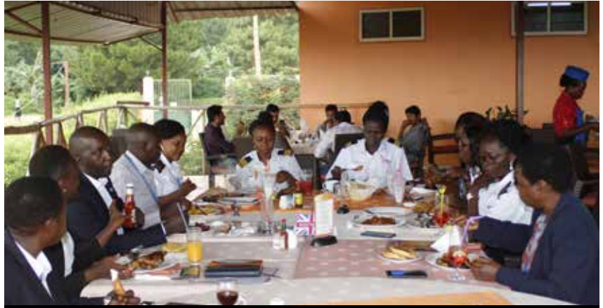
The team was treated to a sumptuous luncheon at Faze 3, Entebbe after the shift.

In celebration of International Women's Day, Entebbe International Airport's Control Tower, Approach Radar and Area Control Center were manned by an all-female Air Traffic Controller's team on March 8, 2019 during the morning shift. The highly trained and vibrant ladies dedicated their efforts on International Women's day to showcase the strides made in empowerment of women, particularly in the areas of science, technology and engineering. The Aviation Forum team captured the moments.