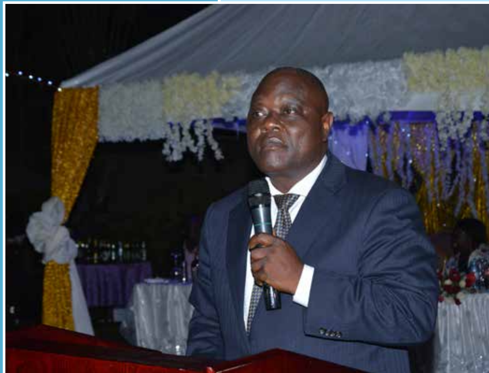
Minister of State for Transport, Hon. Aggrey Bagiire addressing staff at the party.

"The projects that are ongoing to upgrade and expand the infrastructure and facilities at Entebbe International Airport are intended to accommodate the current and future air traffic growth in the industry," the Minister added.