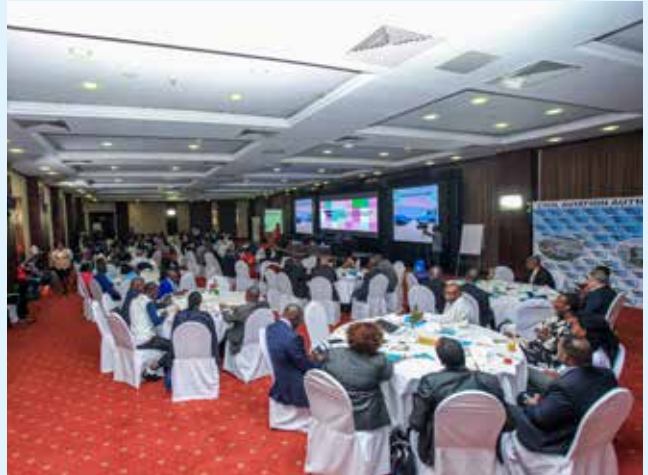
Stakeholders at the breakfast listen to the Minister of Works and Transport, Hon. Monica Azuba Ntege make her presentation at Kampala Serena Hotel on December 6, 2018.