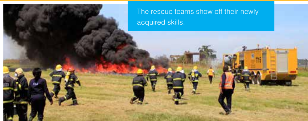
The rescue teams show off their newly acquired skills.

The marine department now has a Catamaran boat (with liferafts of carrying capacity 32 persons), Rescue one (with liferafts of carrying capacity 222 persons) and Rescue two (with liferafts of carrying capacity 222 persons).