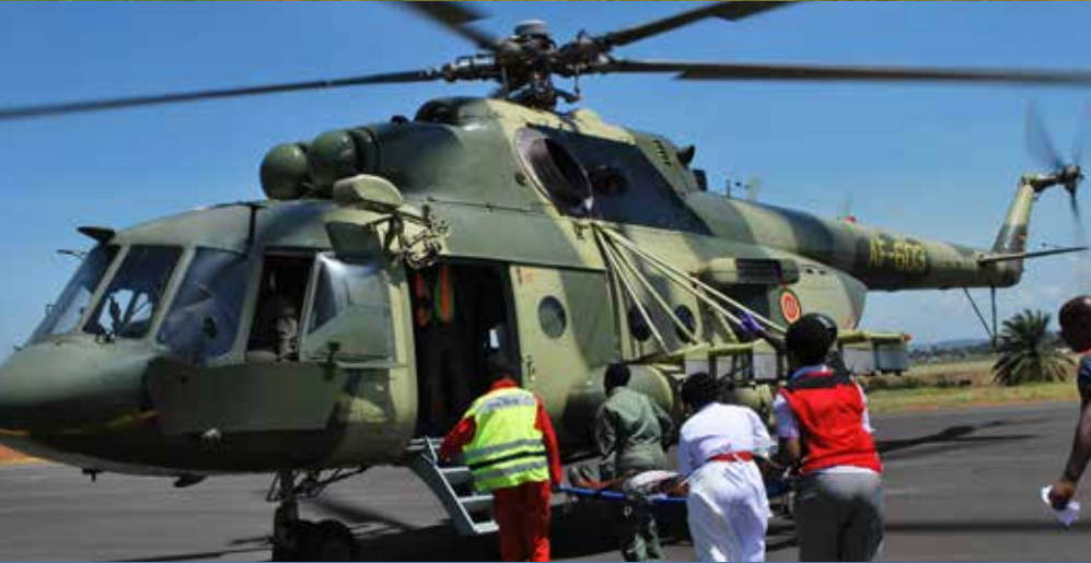
Uganda Peoples Defense Air Force (UPDAF) were on site to transport "survivors" to health facilities in Kampala.