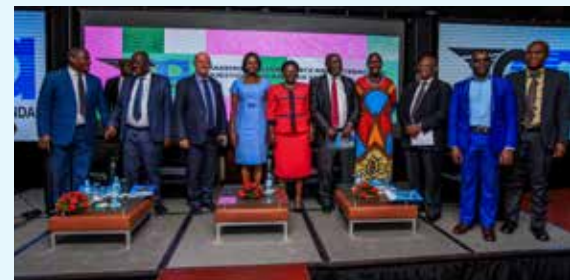
The Minister of Works and Transport, Hon. Monica A. Ntege (center) with CAA Board, Management and stakeholders at the breakfast engagement.

The event was widely broadcast and viewed live on NTV and BBS TV and can still be accessed on the CAA You tube page @ https://youtu.be/HKUXU67vNbc