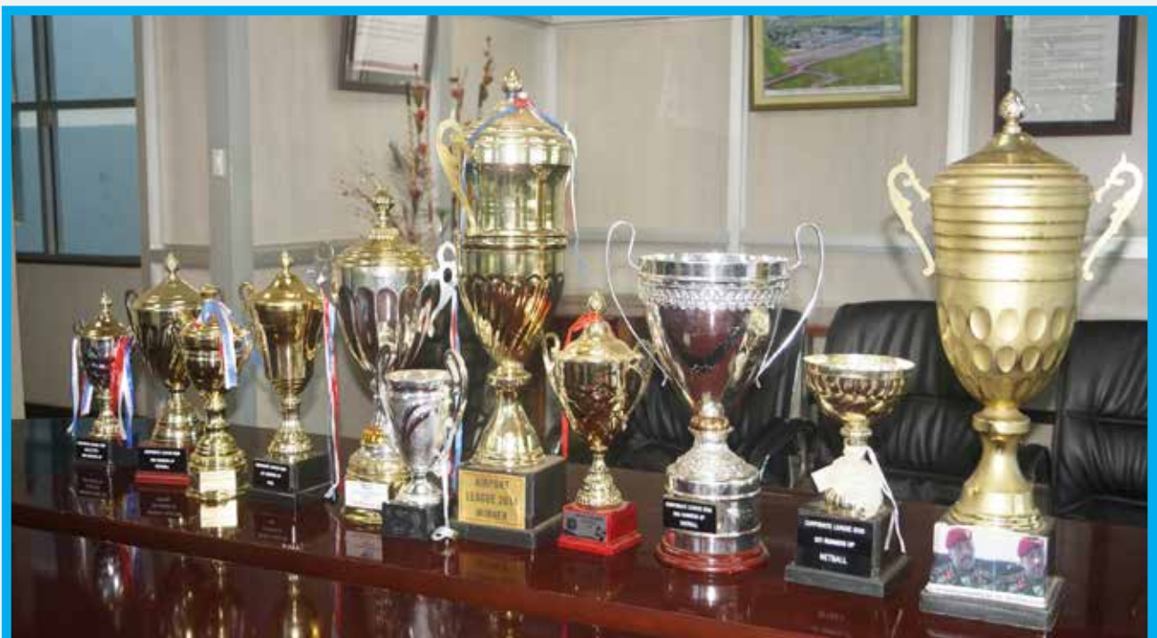
A lineup of trophies CAA has won at different tournaments.