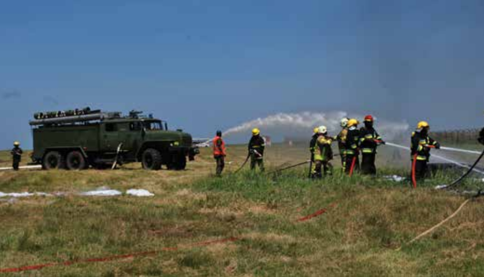
CAA's Fire and Rescue services personnel put out the fire during the exercise.