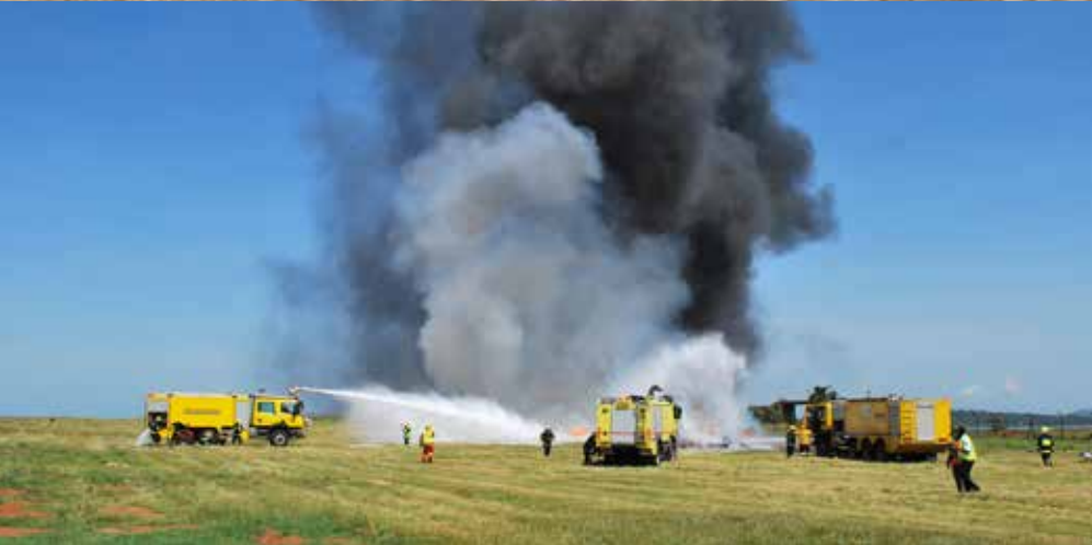
CAA's Fire trucks put out the raging fire during the drill.