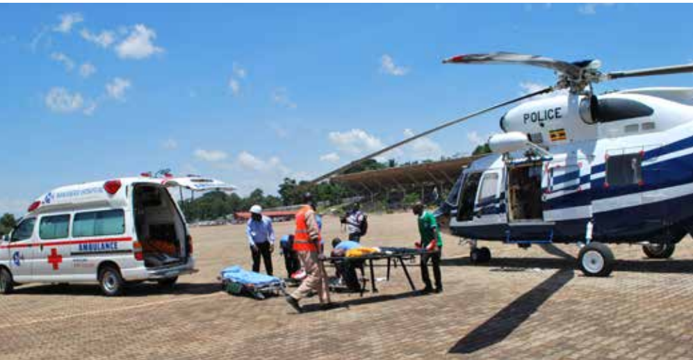
The emergency response teams from Police Airwing and Nakasero hospital take "survivors" for treatment.