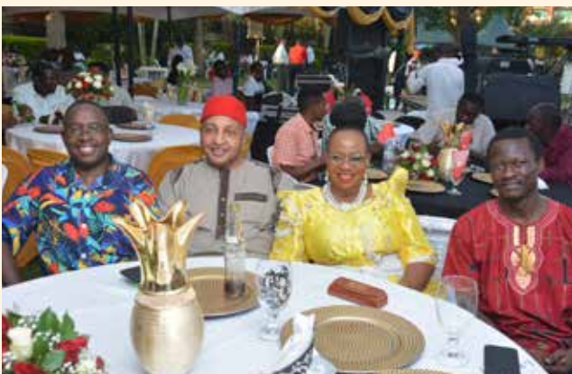
The Directorate of Human Resource and Administration was very well represented.