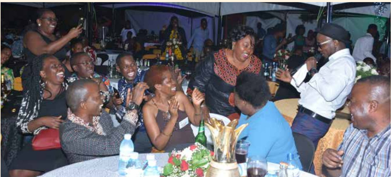
Artist Ykee Benda moved the crowds to endless joy, fun and laughter.